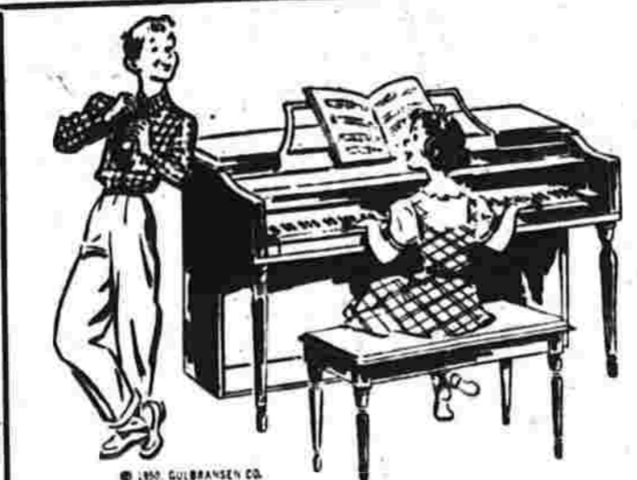
Mom says our piano lessons will make us great people some day