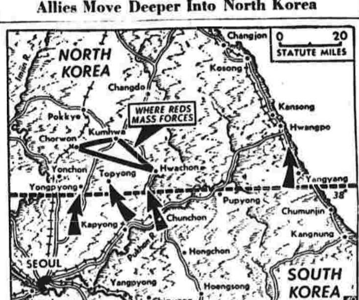
Black arrows show where Allied troops continued thrusting forward across the 38th parallel April 5. On the east coast, where opposition was light, two South Korean units were sent to make a surprise move. Above the parallel an estimated one-half million Reds (triangle) are massing for an expected counter-offensive.