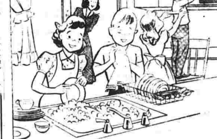
It's easy... with co-operation

This is a true of a party-line telephone, too. Party-line service is good when everybody keeps calls brief and allows time between calls. You're sharing... with national defense Your telephone company has added more telephones in the past five years than in its first 48 years. We plan to continue building as fast as the national emergency permits, raising... for the military... for war industry... for civilian defense.